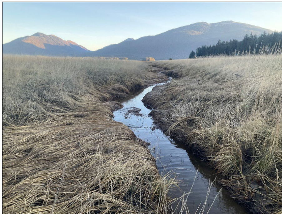
Figure 1.—Downstream view of tributary 1 at waypoint 1079.