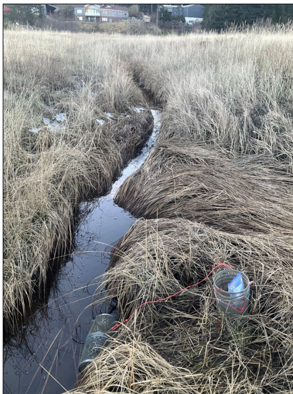
Figure 3.—Upstream view of tributary 1 at waypoint 1077.