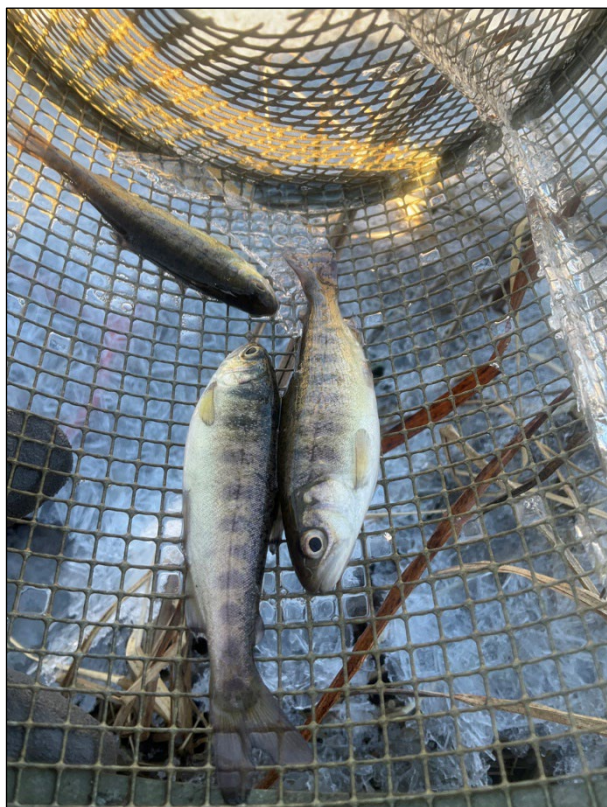
Figure 2.—Juvenile coho salmon captured at waypoint 1077.